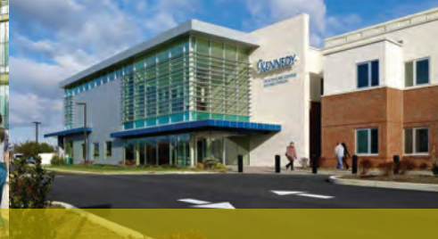
Above (L to R): Winnie Palmer Hospital Pond, FL | Orlando Health Central Campus Master Plan, FL | Kennedy Health System, PA