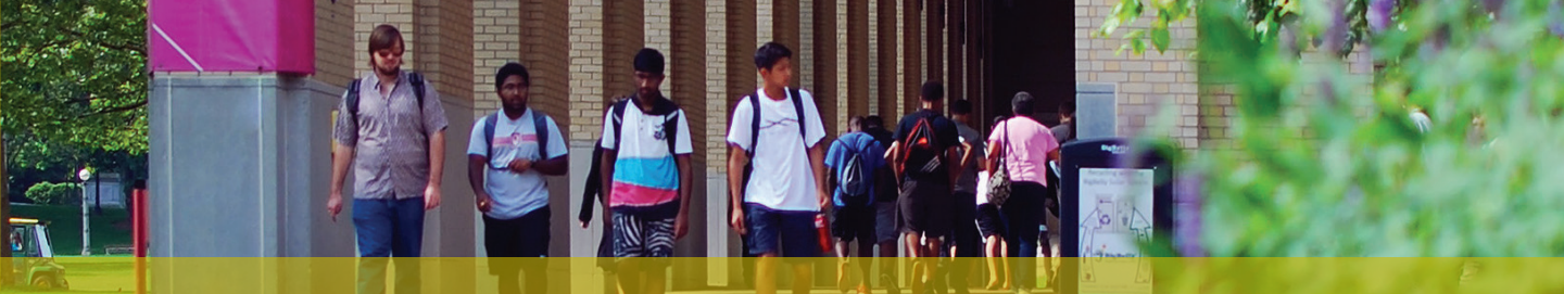
Above: Carnegie Mellon University, PA